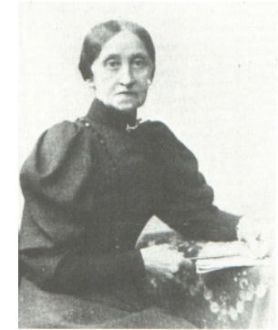
Prof. Dr. h.c. Johanna Mestorf (1828-1909)